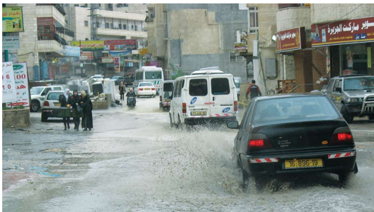
Main road in the Shufat Refugee Camp

be solved by widening the main water pipes but refused to install additional infrastructure or to connect homes to the grid, claiming that most of the residents live in homes constructed without permits. The petitioners argued that such action would not solve the problem and would only perpetuate the violation of residents' basic rights. They further argued that residents had no recourse but to construct homes without permits due to the authorities' long-standing failure to plan the area. And, according to the petitioners, in similar instances solutions had been found enabling the connection of homes to the water grid.