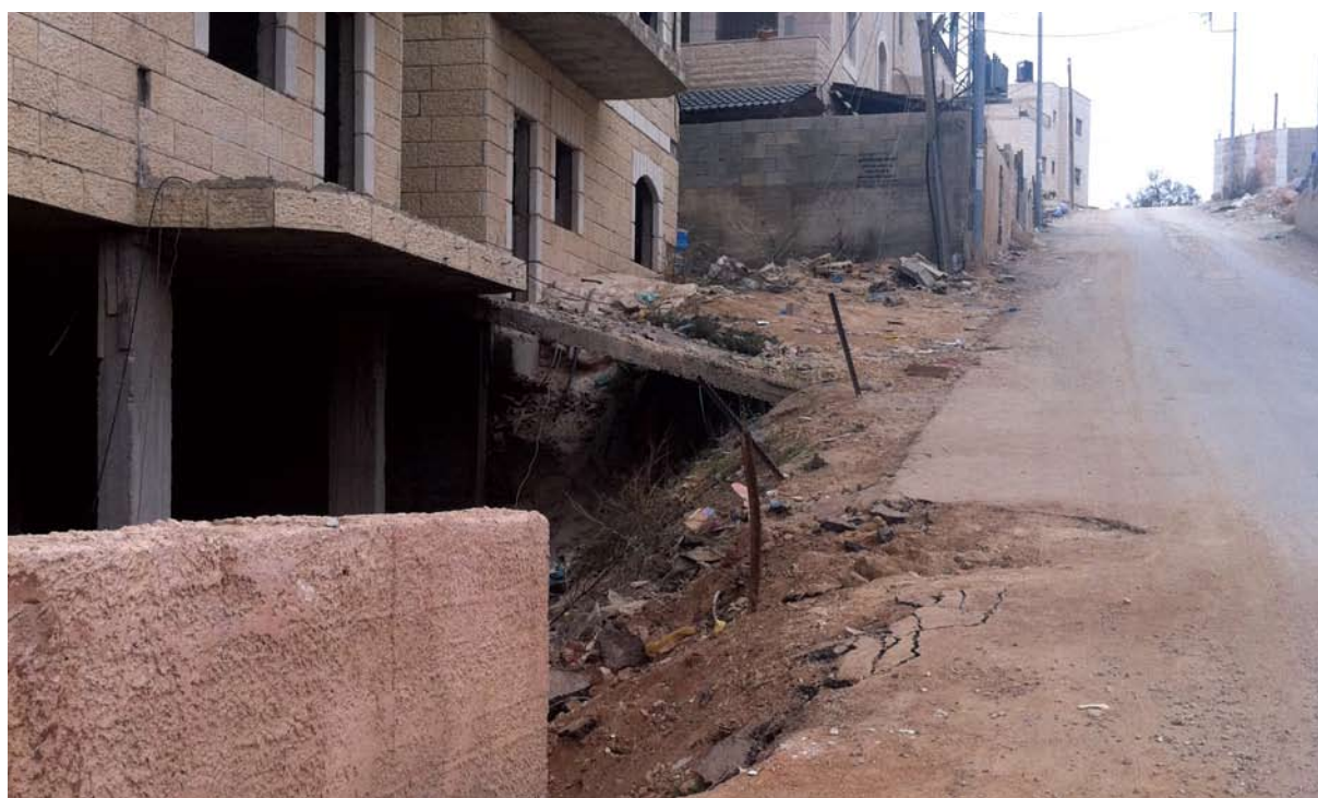
Collapsed road in Kufr Aqab

arrangement is maintained that permits its implementation.” 85 This is not the only instance in which security has been used as a pretext for withholding services from the residents of the neighborhoods beyond the Barrier, despite the fact that the unique security situation in these neighborhoods is a direct result of the actions of the Israeli authorities. Moreover, and as emerges from Attorney Liebman’s comments, the issue of security has become a means for transferring responsibility from the civilian authorities to the military. The significance of this process will be discussed in greater detail.