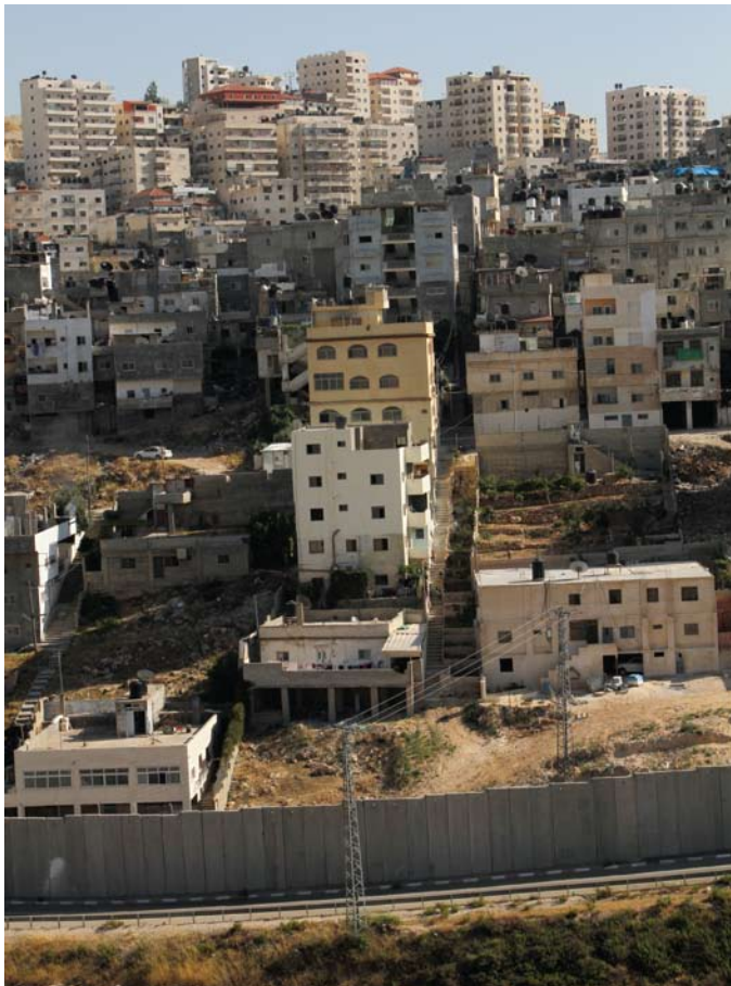
Shuafat Refugee Camp, with Ras Shehadeh in the background

In contrast to its activities in other parts of Jerusalem, the Municipality does not contact organizations representing the residents, such as neighborhood committees, or international organizations such as UNRWA, to prepare residents for a potential disaster. Theoretically, it would be possible to strengthen the buildings, but it is unlikely in the current circumstances. Von Toggenburg adds that in order to prepare for possible disasters in the refugee camp, UNRWA has begun to conduct emergency preparedness trainings for teams of local residents. The agency has invited experts in the rehabilitation of favelas from Latin America who tackle the massive slum neighborhoods alongside the major cities of Brazil, also constructed illegally and without suitable infrastructures. 122