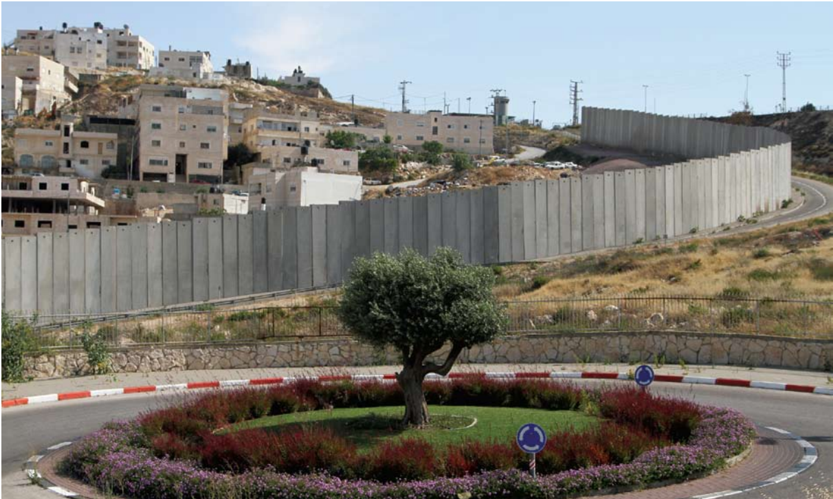
A view from Pisgat Ze'ev to Ras Khamis

As we saw in Chapter One, since Israel annexed East Jerusalem it has repeatedly declared the “unity” of West and East Jerusalem. However, this unity relates solely to the land of East Jerusalem and not to its Palestinian population – residents who are not Israeli citizens. These residents have faced massive pressures, including profound neglect in the provision of physical and social infrastructures, a grave housing crisis, and ongoing threats to their residency status. Construction of the Barrier intensified the division and segregation of Palestinian space in Jerusalem, disconnecting entire neighborhoods from their municipal lifeline and from sources of livelihood and identity. This policy has consistently pushed the poorer and weaker residents of East Jerusalem into the neighborhoods beyond the Barrier.