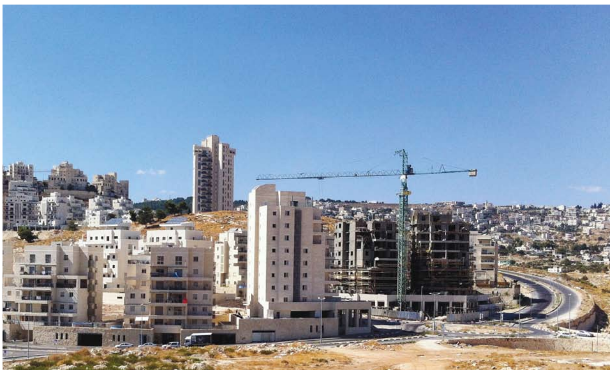
Expansion of Har Homa against the backdrop of Sur Baher, where planning and construction is restricted